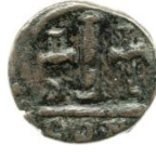
3.63 gms; EBCC 5.34; 918.03