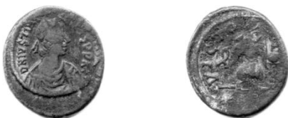
DOC 304; 5.77 gms; EBCC - ; 2131.16