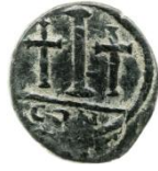
5.12 gms; EBCC 5.35; 2066.14