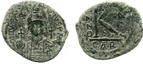
Regnal year 17 (543/4) DOC - ; MIBE - ; 8.47 gms; EBCC 5.19; 673.00