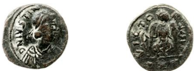
DOC 304; 4.55 gms; EBCC 5.23; 129.86