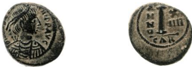
Regnal year 14 (540/1) DOC 298; 5.06 gms; EBCC 5.21; 366.90