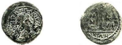
Regnal year 16 (542/3) DOC 299; 6.28 gms; EBCC 5.22; 982.05