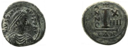
Regnal year 14 (540/1) DOC 298; 5.45 gms; EBCC 5.20; 29.83