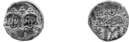
DOC 11; 2.67 gms; EBCC - ; 2252.17