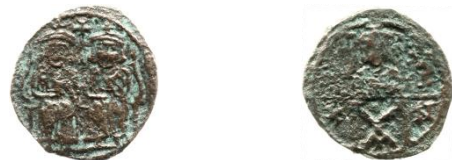
DOC 13; 3.01 gms; EBCC 29.3; 209.88