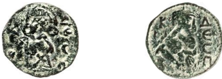
DOC 55; Sp. 321; 2.62 gms; EBCC 28.13; 491.95