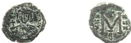
DOC 6b; 3.39 gms; EBCC 29.1; 1475.10